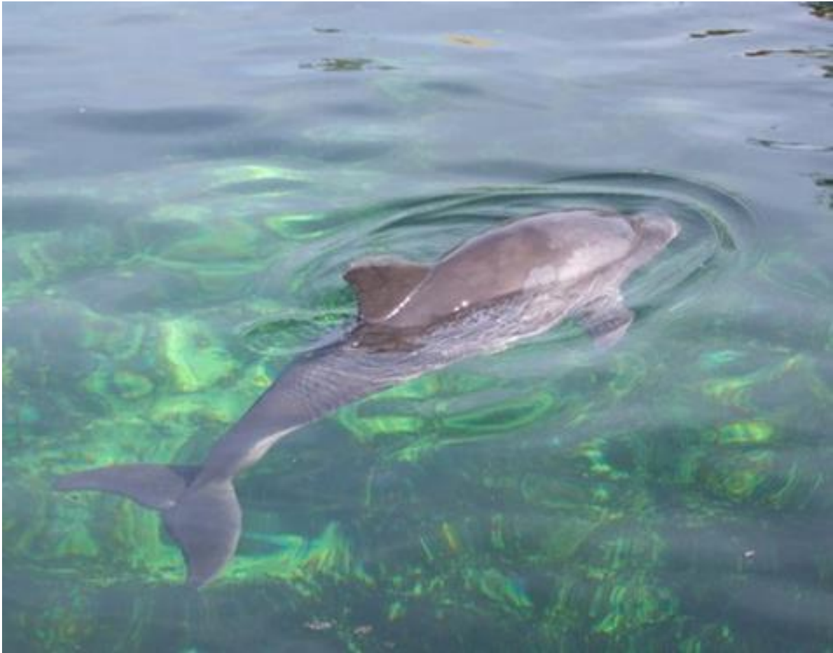
Fig. 1 Harbour porpoise